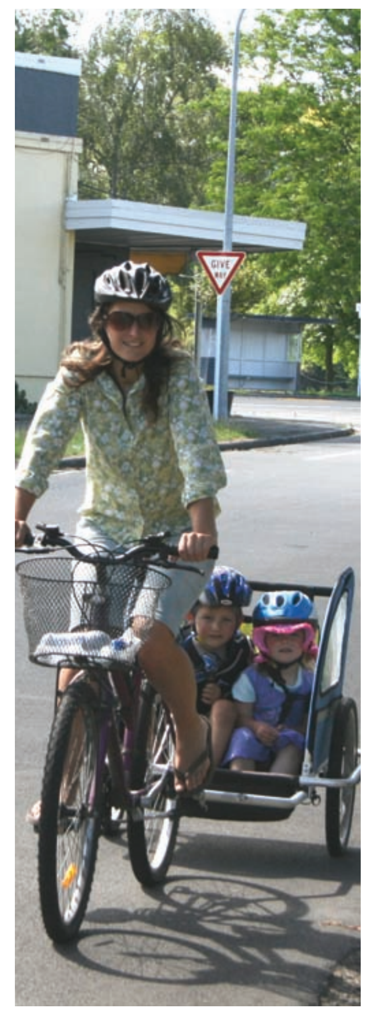
'Bike taxi' to school.

Monitoring of the strategy will be guided by the Transport Monitoring Indicator Framework (TMIF) prepared by the MoT. This TMIF sets out a consistent framework for transport monitoring across the country.