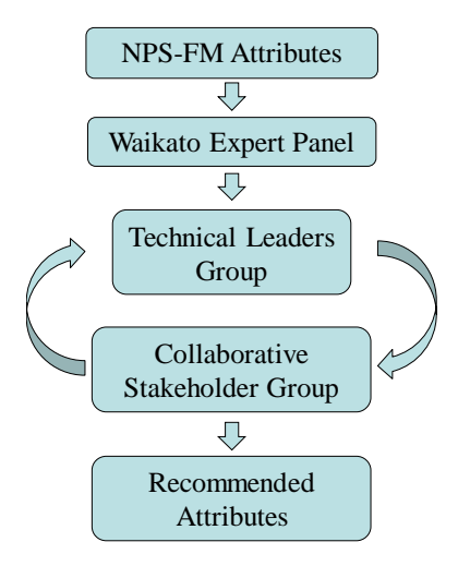
Figure 1. Process diagram showing steps in development of attributes appropriate to core values in Healthy Rivers: Wai Ora plan change.