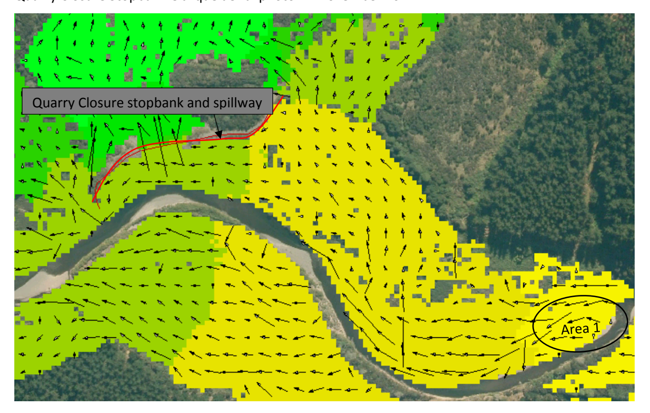
Quarry Closure Stopbank and upstream area – flow vectors