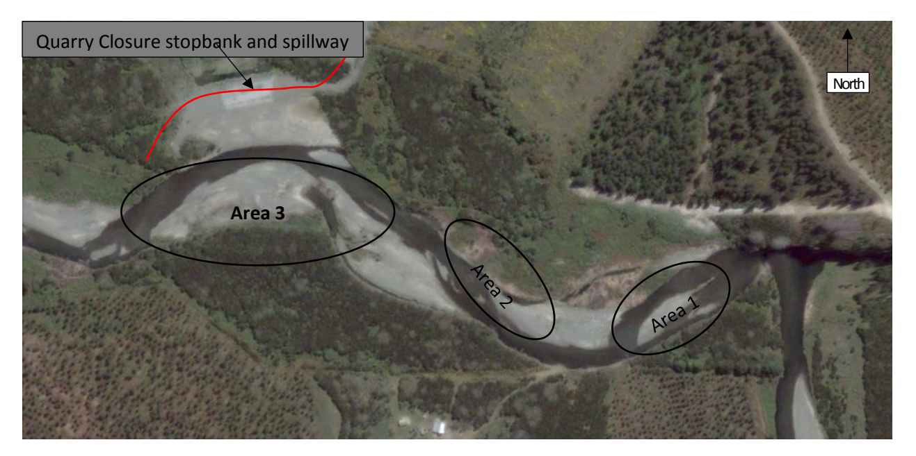
Quarry Closure Stopbank and upstream area 2005 Aerial Photo