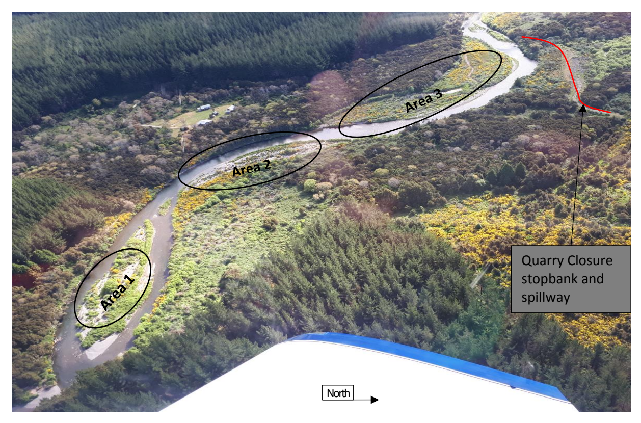
Quarry Closure Stopbank Oblique aerial photo 14 November 2017