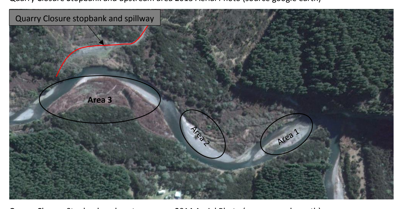
Quarry Closure Stopbank and upstream area 2014 Aerial Photo