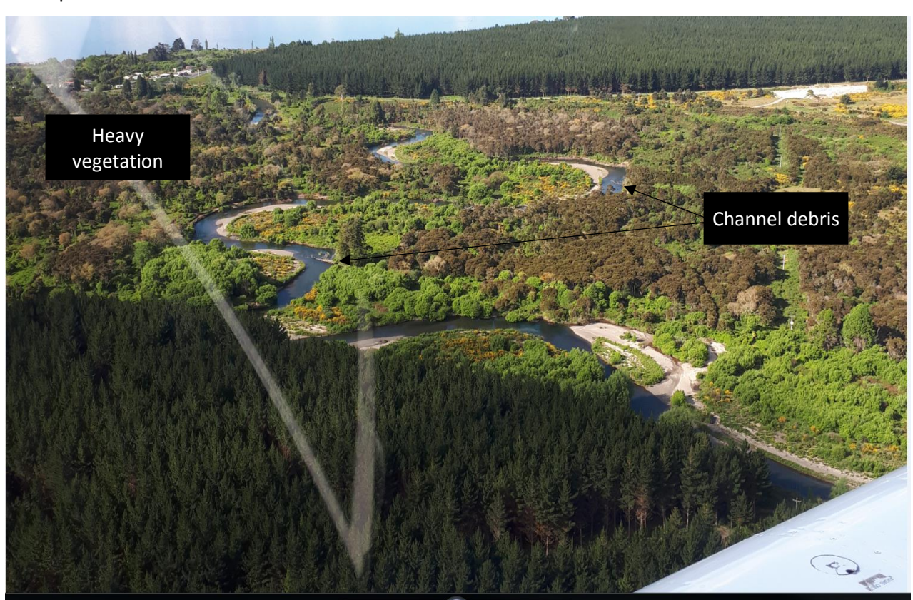
Area downstream of Maniapoto's bend adjacent to the western stopbank