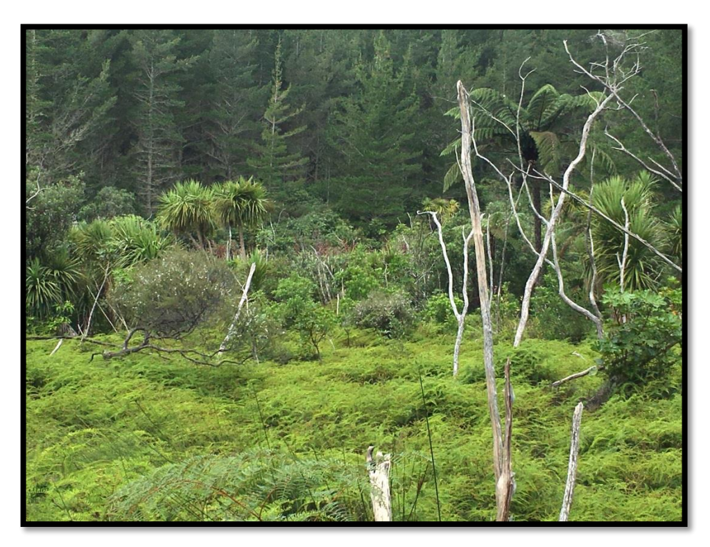
IMAGE 2: MANUKA-TANGLE FERN ASSOCIATIONS, UPPER DUCK CREEK CATCHMENT.