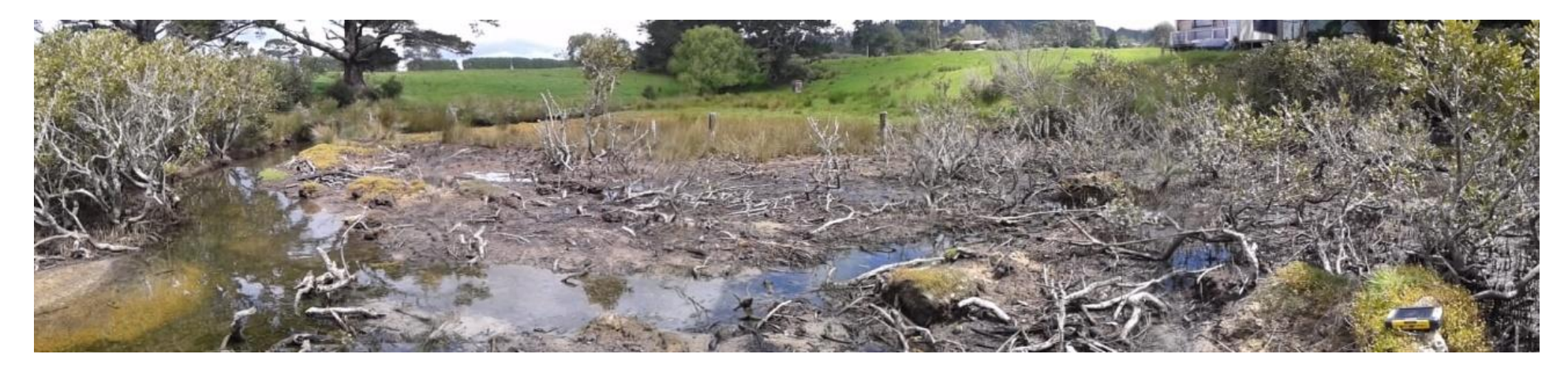
Figure 10: A severely pugged and grazed edge of the harbour.