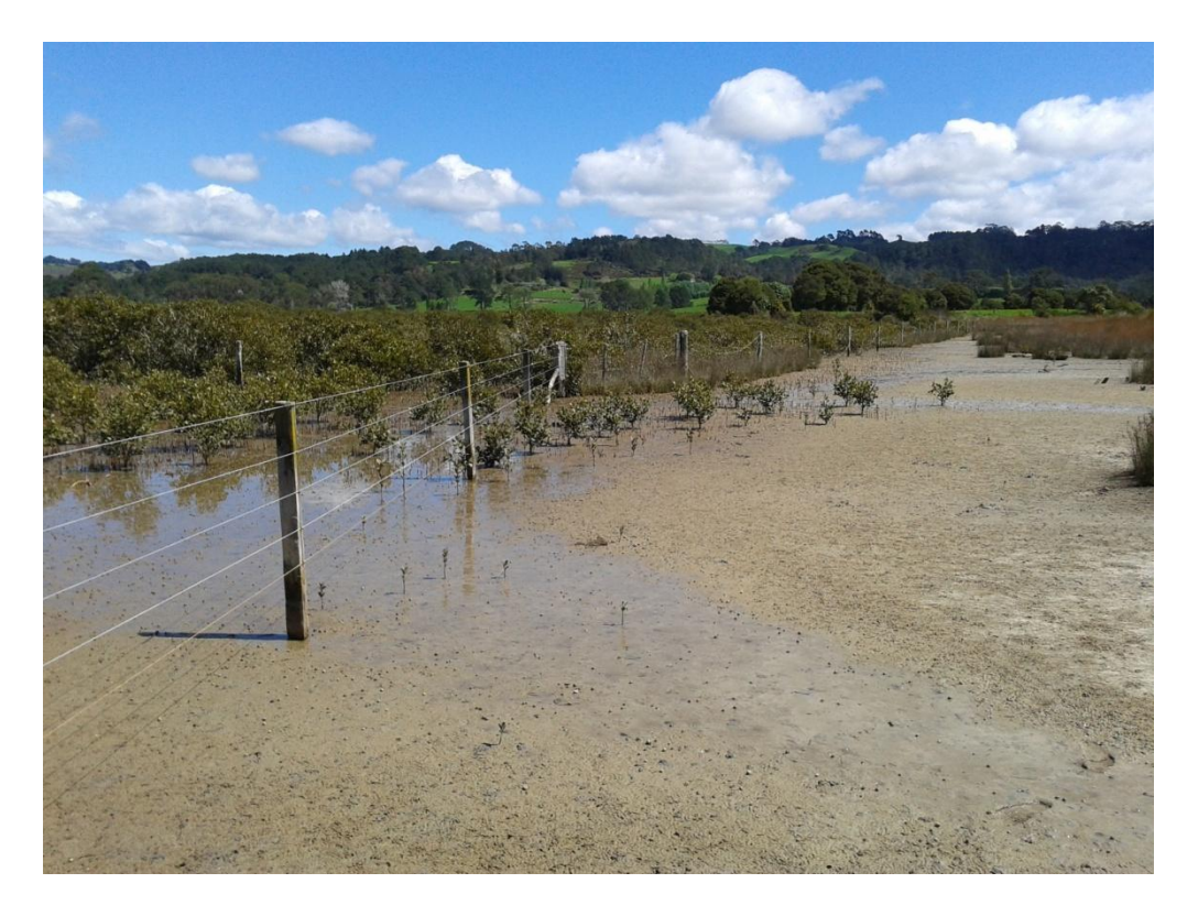
Figure 6: An old fence line cutting across an arm of the harbour shows the effect historic grazing has had on the estuarine vegetation communities. Mature mangroves, rushland and saltmarsh ribbonwood are present on the un-grazed side whereas only juvenile mangroves are present on the historically grazed side with rushland.