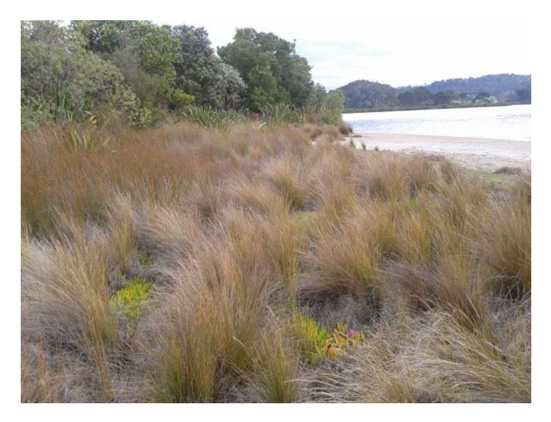
Figure 11: A view over a mixed coast spear grass /saltwater paspalum community near the boat ramp that also has African ice plant present. A mixed glasswort / saltwater paspalum community is found seaward and along the landward edge is oioi and some saltmarsh ribbonwood.