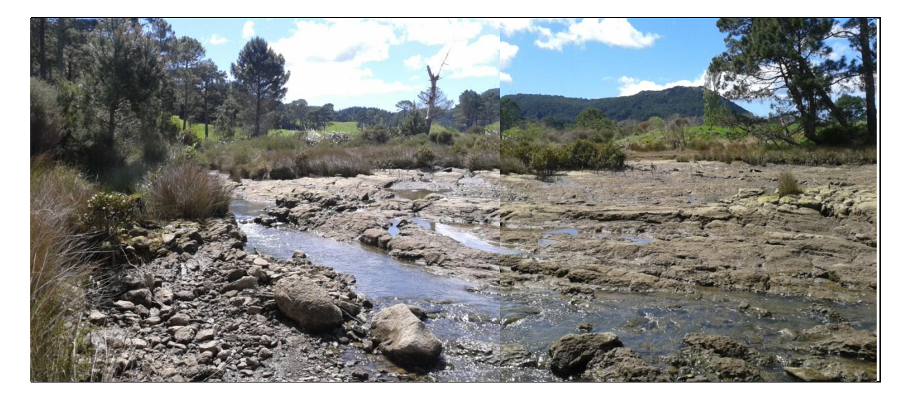
Figure 4: A view of the upper tidal reaches of the Lees Road stream catchment showing the rocky bedrock with a mix of short mangroves, ribbonwood, sea rush, oioi, saltwater paspalum.