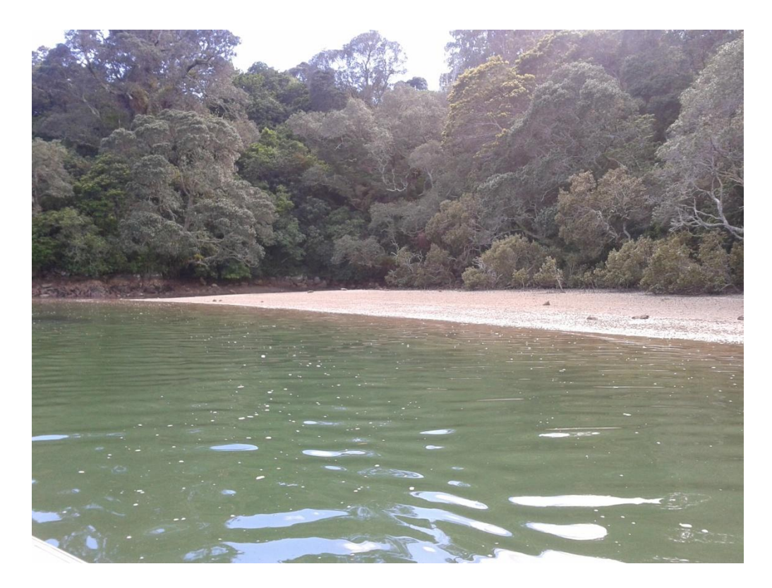
Figure 2: View of mangroves beneath a pohutukawa fringe near the entrance of the Purangi Estuary (TRB).