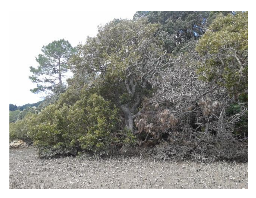
Figure 9: A large mangrove near the head of Diggers Hill that is about 7m tall. Oysters were common on the pneumatophores of these trees at the mouth of the embayment.