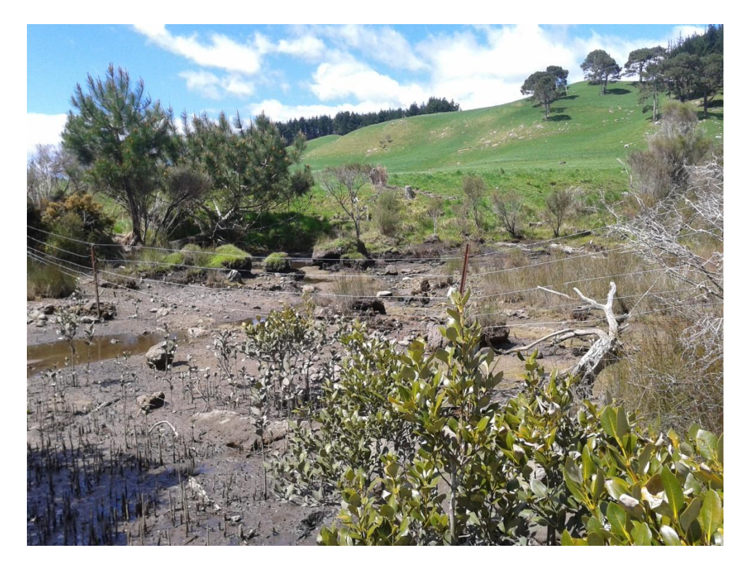
Figure 5: A fence line cutting across a small indent of the harbour leaving mangroves, rushland and saltmarsh ribbonwood on the ungrazed side and humped areas with sea meadow and rushland on the grazed side.

Figure 4: A view of the upper tidal reaches of the Lees Road stream catchment showing the rocky bedrock with a mix of short mangroves, ribbonwood, sea rush, oioi, saltwater paspalum.