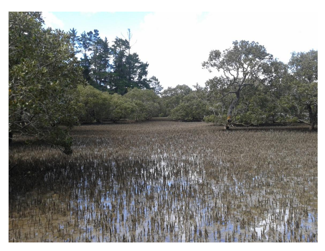
Figure 3: Large mangroves (ranging 5-8m tall) in an embayment along the TRB of the harbour upstream of the island.

Figure 2: View of mangroves beneath a pohutukawa fringe near the entrance of the Purangi Estuary (TRB).