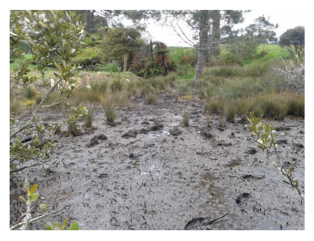
Figure 7: Here the harbour edge has been in-filled and the incomplete fence line did not stop stock gaining access to the harbour edge. Evidence of pugging and grazing of rushland and mangroves was found in this locality.

Figure 6: An old fence line cutting across an arm of the harbour shows the effect historic grazing has had on the estuarine vegetation communities. Mature mangroves, rushland and saltmarsh ribbonwood are present on the un-grazed side whereas only juvenile mangroves are present on the historically grazed side with rushland.