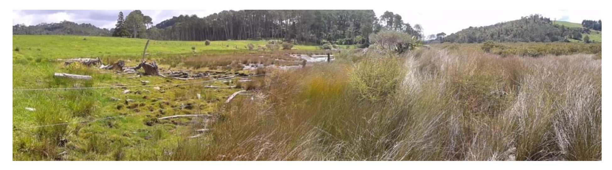
Figure 8: Looking along a stopbank and drain that separates the inland harbour edge from the main harbour. Grazed and pugged sea rush, slender clubrush, remuremu, glasswort and saltwater paspalum are present within the paddock while healthy saltmarsh ribbonwood, rushland and mangrove communities are found seaward of the paddock.