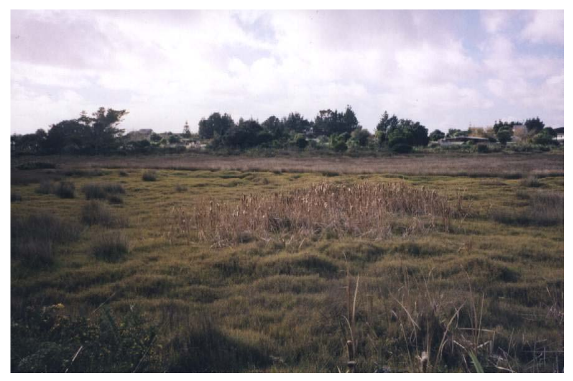
Figure 2: A clump of raupo surrounded by P. vaginatum . Graham's Stream arm of Tairua Harbour. June 2000. Hamish Kendal