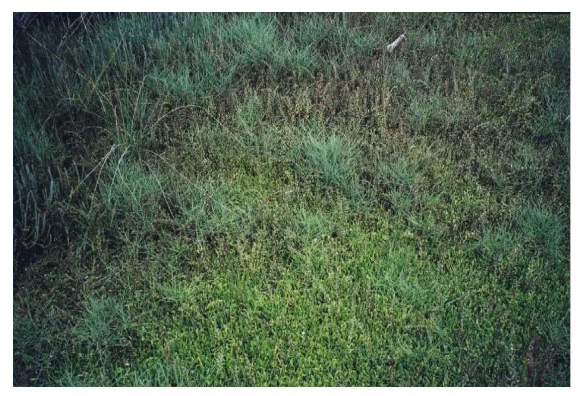
Figure 6: This photograph shows Sarcocornia quinqueflora, Selliera radicans , and Samolus repens intermingle with P. vaginatum. Whitianga Harbour. January 1999. Meg Graeme