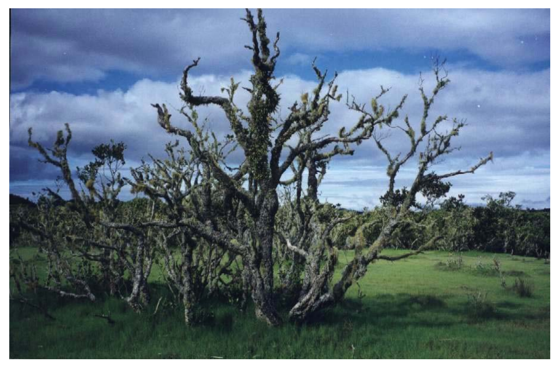
Figure 4: P. vaginatum surrounds this old dead mangrove in Hodges arm of Whitianga Harbour. January 1999. Meg Graeme