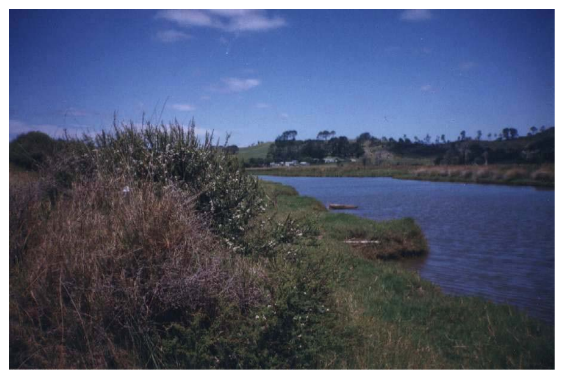
Figure 9: P. vaginatum dominating the Pungapunga River banks (upstream of tidal lagoon) and climbing up through Leptospermum scoparium . November 2000. Hamish Kendal