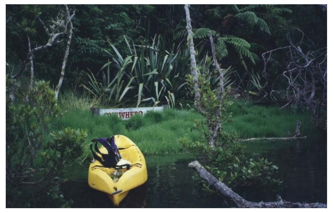
Figure 5: Between the mangroves and coastal forest, P. vaginatum forms a dense lush band at high tide. Onewhero Scenic Reserve. January 1999. Meg Graeme