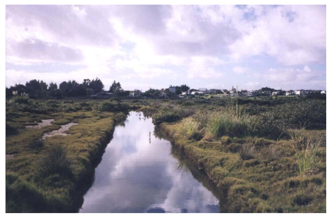
Figure 3: P. vaginatum lines the banks of this drain in the Graham's Stream arm of Tairua Harbour. June 2000. Hamish Kendal