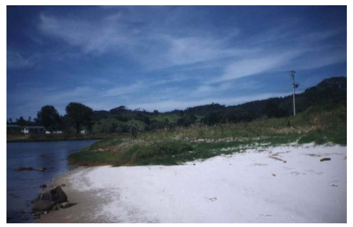
Figure 8: P. vaginatum extends from above MHWS down to below the water mark of the Pungapunga River lagoon, Whangapoua. December 2000. Hamish Kendal