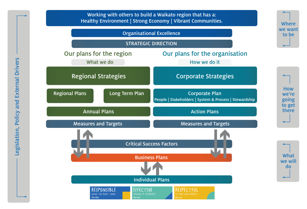
Figure 3: Waikato Regional Council Planning Model

The Strategic Direction for the Waikato Regional Council 2013-2016<sup>1</sup> was adopted in 2013 and sets out the strategic focus and priorities for the council. The strategic direction is supported by a range of strategies, plans and operational activities. Figure 3 below sets out how these fit together.