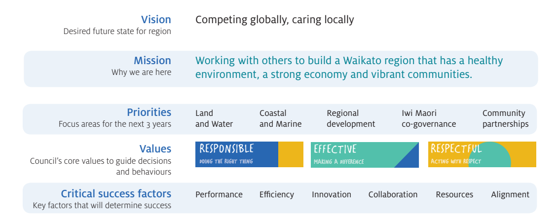
Figure 4: Summary of the Waikato Regional Council strategic direction

The key components of the strategic direction including the council's vision, mission, priorities, values and critical success factors are summarised in figure 4.