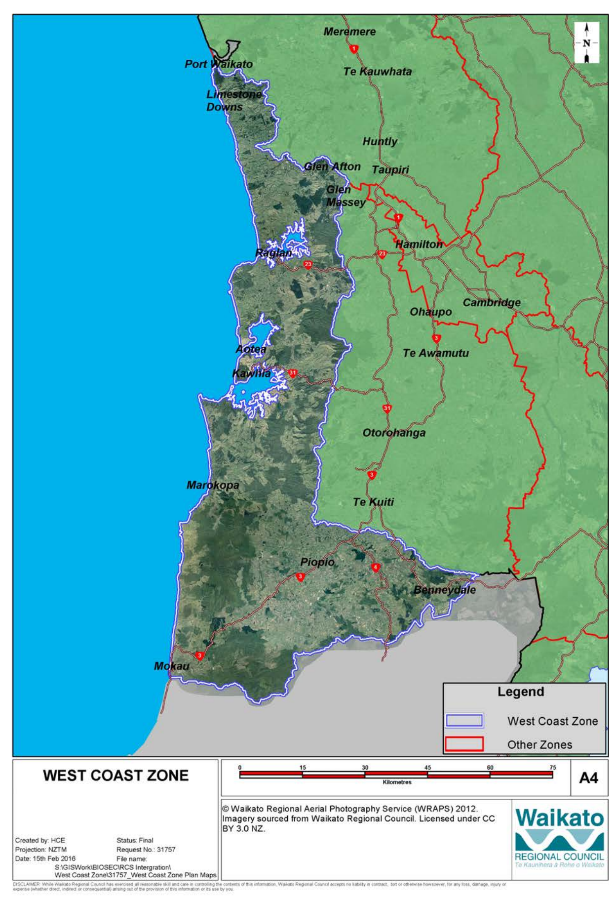
Figure 6: West Coast zone