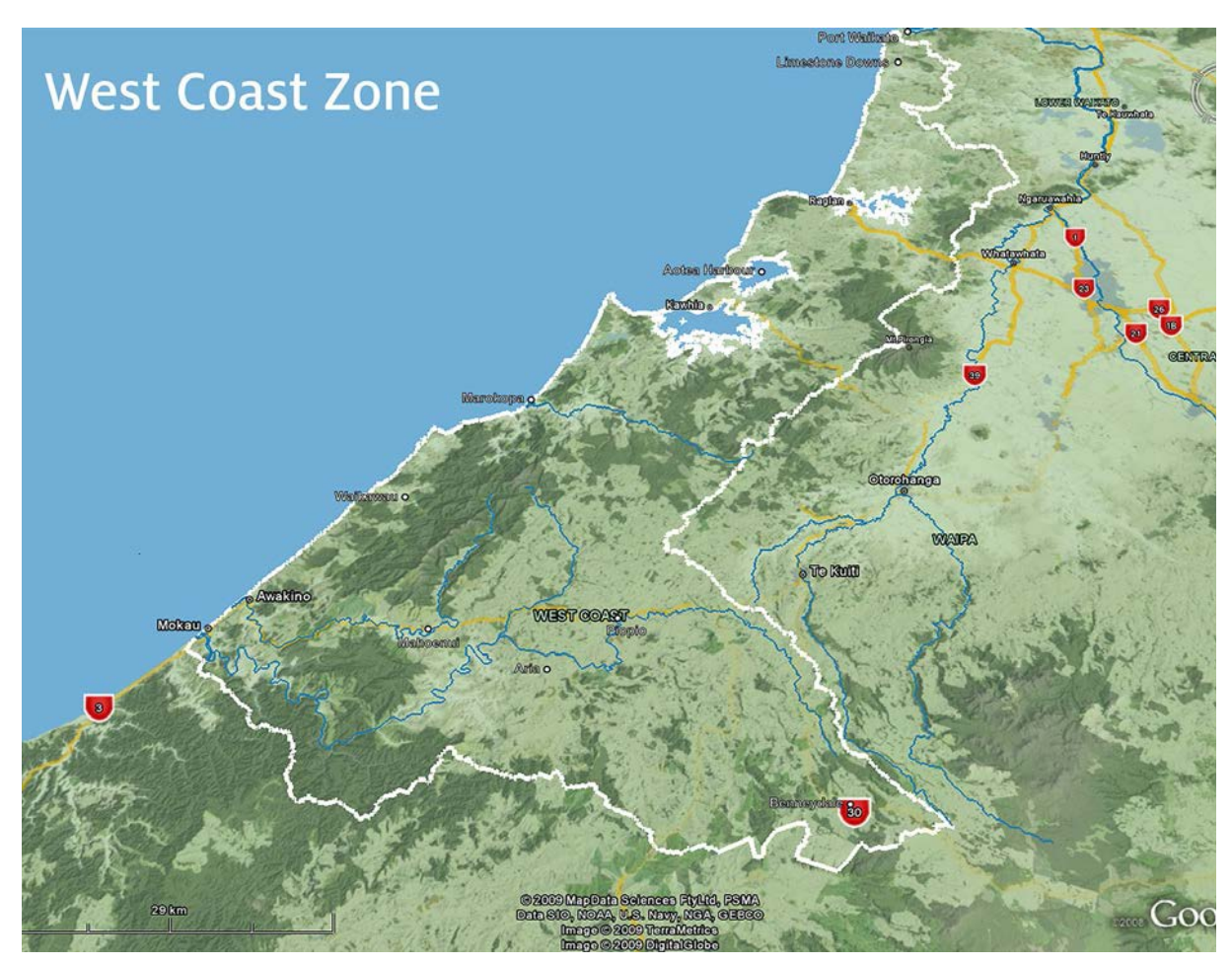
Figure 7: Angle view of West Coast zone

Coastal landforms along the West Coast are diverse and include sand and boulder beaches and wave-cut platforms backed by dunes, dune lakes or coastal pastures in some areas and by rocky headlands and the seaward faces of steep coastal hills in others. The mouths of streams, rivers and harbours cut through dunes and escarpments and discharge into the sea. In parts of the zone, there are small islands and coastal rock stacks out to sea. The vegetation growing in this landscape is correspondingly diverse, reflecting not only the variety of landforms, but also the degree of exposure to salt and wind from the sea. Vegetation ranges from dune tussock grassland, to cliff herb and shrub communities, to flaxlands, to pohutukawa or kohekohe treelands and forests.