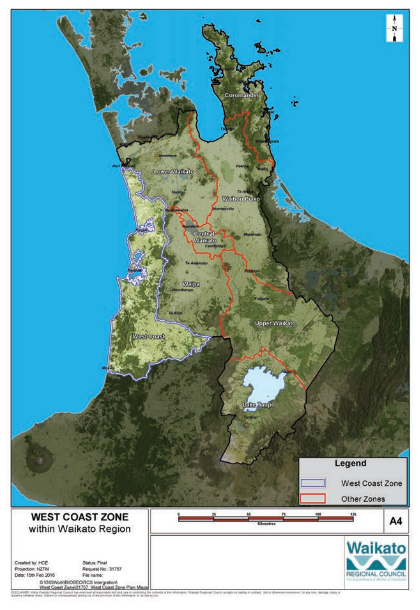
Figure 5: West Coast zone relative to the Waikato region

The zone encompasses three district councils; Waitomo, Otorohanga and Waikato; and overall has a low population base of less than 3 per cent of the region's population (Statistics New Zealand, 2006). Key settlements include Aotea, Aria, Awakino, Benneydale, Kawhia, Marokopa, Mokau, Piopio, and Raglan (see figure 6). Some isolated rural areas are experiencing population decline which may threaten the viability of some communities.