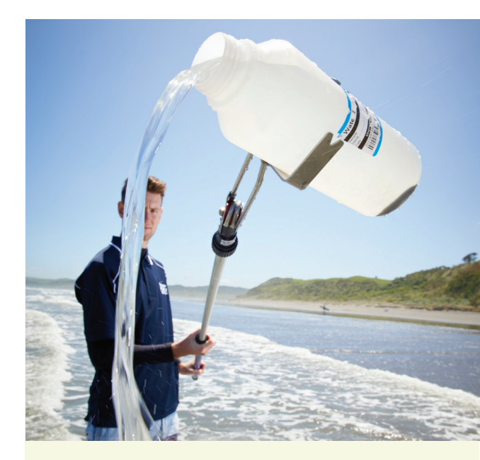
Waikato Regional Council staff member water testing in Raglan.