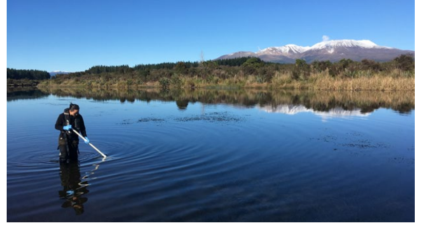
Water samping being undertaken by Horizons Regional Council