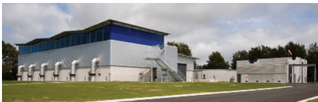
GAC & UV Building

The purpose of a GAC filter is to remove organic chemicals, some of which are created by algae and which can cause problems such as musty taste & odour. Some algae (known as Cyanobacteria or Blue Green Algae) can potentially create toxins and the GAC filters protect against that threat.