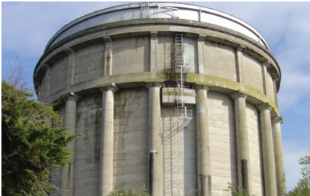
Ruakiwi Reservoir - Hamilton's historic landmark