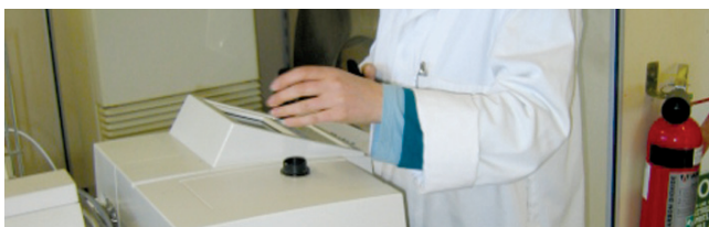
Our technicians test Hamilton's water quality

The City Waters Unit, with support from The City Delivery, City Development and Business Support Units, provide customer and management services. Responding to customers includes water supply connections, enquiries regarding pressures, flows, quality issues, location and giving general advice. Regular customer surveys are used to assess and improve council services.