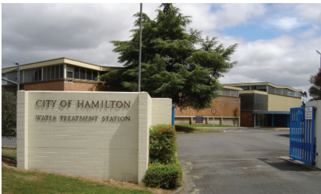
Hamilton City's Water Treatment Plant

The HCC Water Treatment Plant was built in 1971 on the banks of the Waikato River off Waiora Terrace. It was originally designed to produce 64 million litres per day (ML/day). This has increased over the years with process improvements and upgrades resulting in the plant now being capable of producing 106 ML/day.