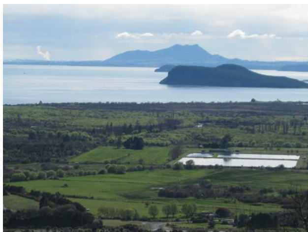
Figure 5: Lake Taupo, New Zealand