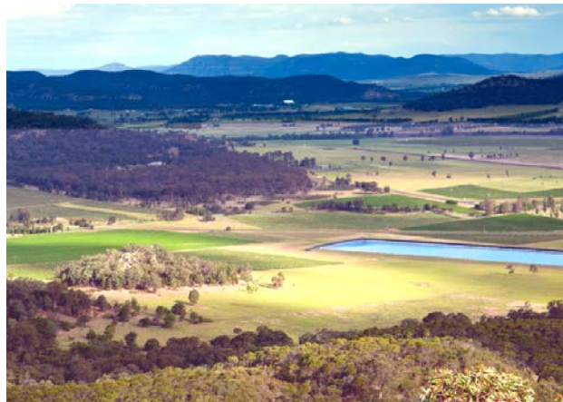
Figure 4: Hunter River Basin, New South Wales, Australia