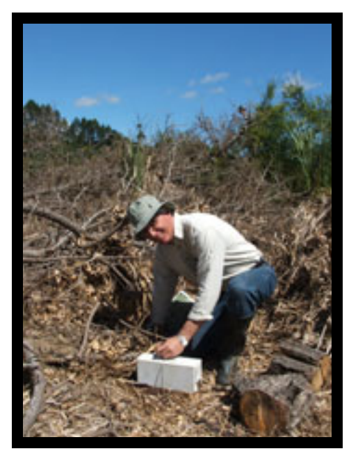
Figure 8. Setting a rat trap

The focus on land cover and pest reduction would see improved forest structure with the ability to provide greater stability during rain events and consequently less erosion, downstream sedimentation and harbour infilling.