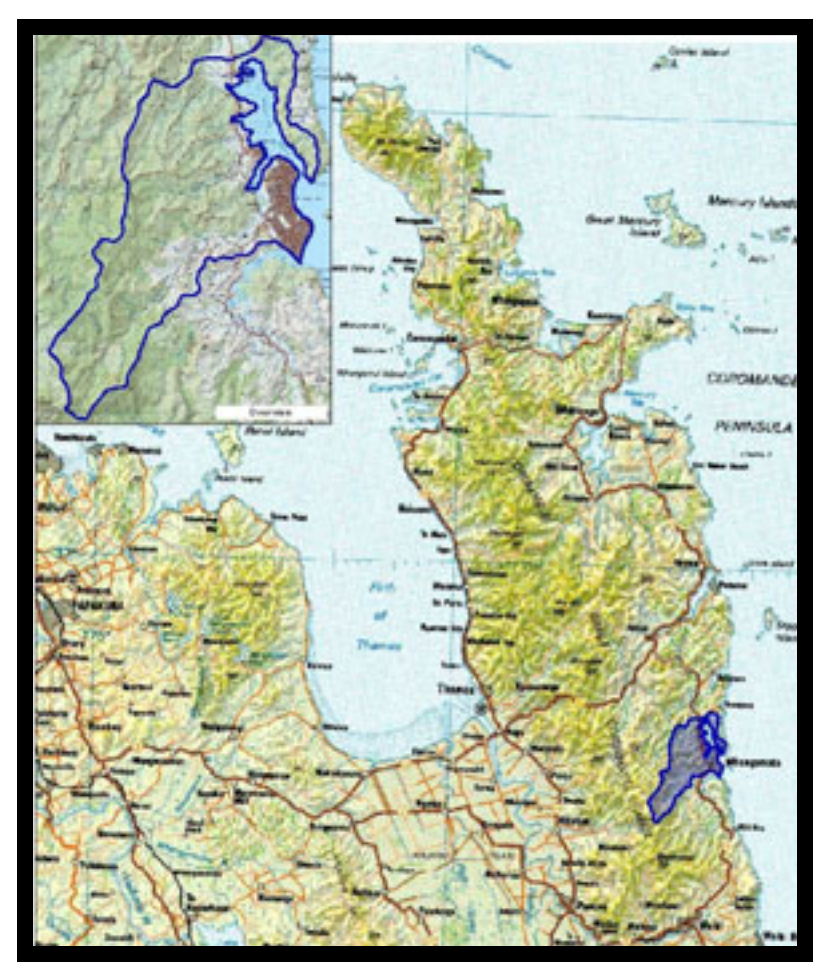
Figure 1. Location of Whangamata Catchment

For the purpose of this catchment management plan, the area of concern is some 5,376 hectares of land. This area is consistent with the catchment zones identified for management purposes under the Peninsula Project.