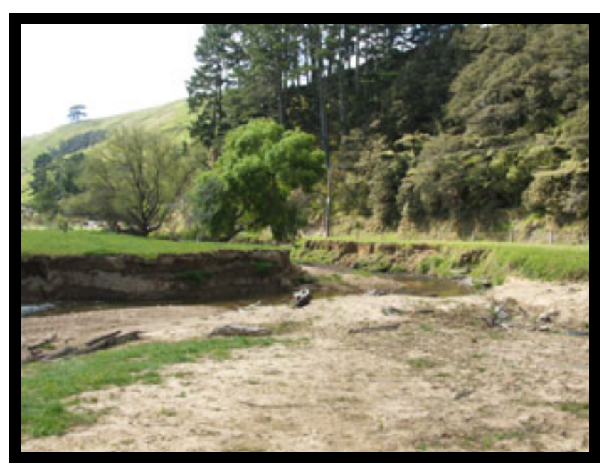
Figure 9. Stream bank erosion in the Wentworth River