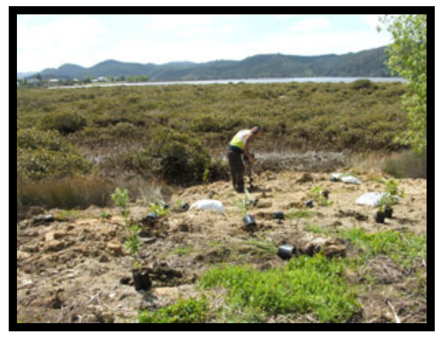
Figure 7. Planting on coastal margin of Te Weiti Stream