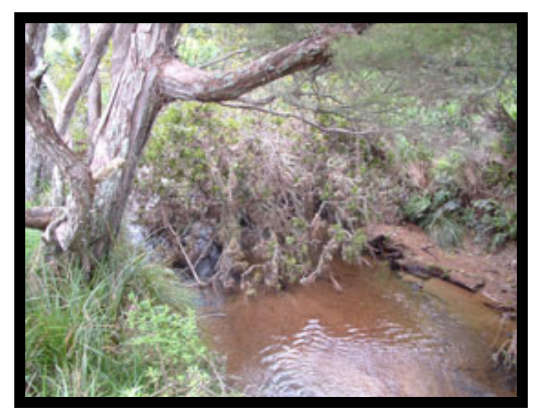
Figure 5. Blockage in Wentworth River channel