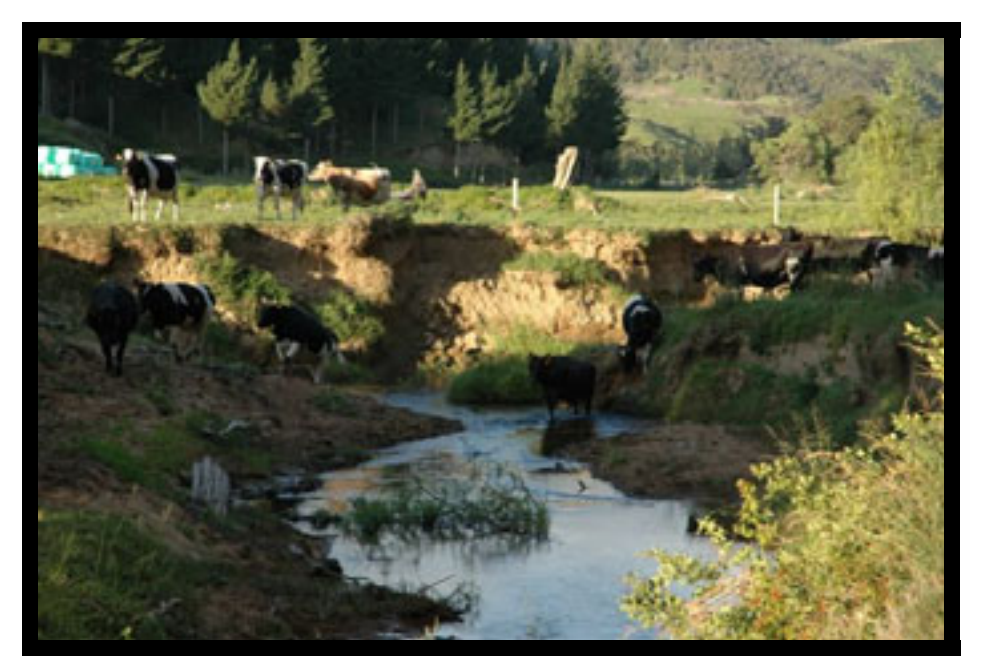
Figure 6. Slumping of the riverbank and stock access