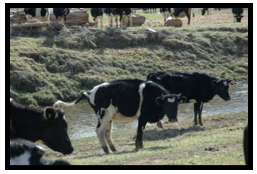
Figure 4. Cattle next to the Wentworth River

Approximately 70 per cent of the main Wentworth channel is fenced to stock class standard and prevents stock from accessing the stream bed. Of the seven tributaries in this catchment area only the Wairoa Stream has any significant riparian protection (90 per cent fenced, good riparian (stream bank or river bank) cover 90 per cent).