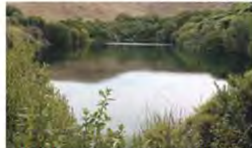
STAGE TWO: Willows and weeds on the banks of a lake formed during the limestone mining on ASS Block in the 1970s will be cleared at a later stage.