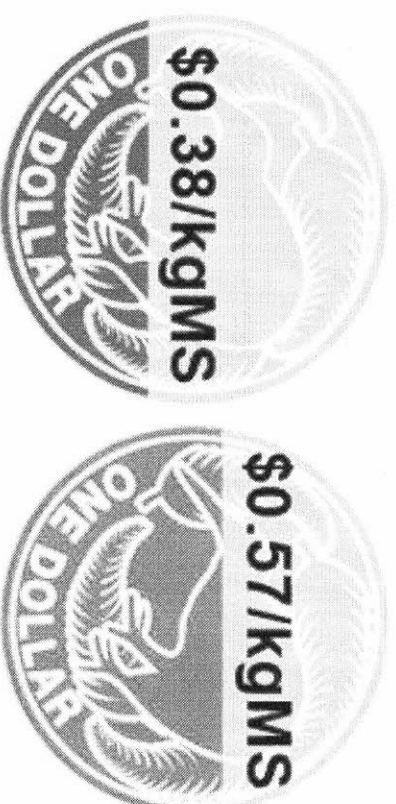
Fig 2. Dairy 20-20 Average fertiliser cost per kg of milk solids over 5 seasons (2010-2015)