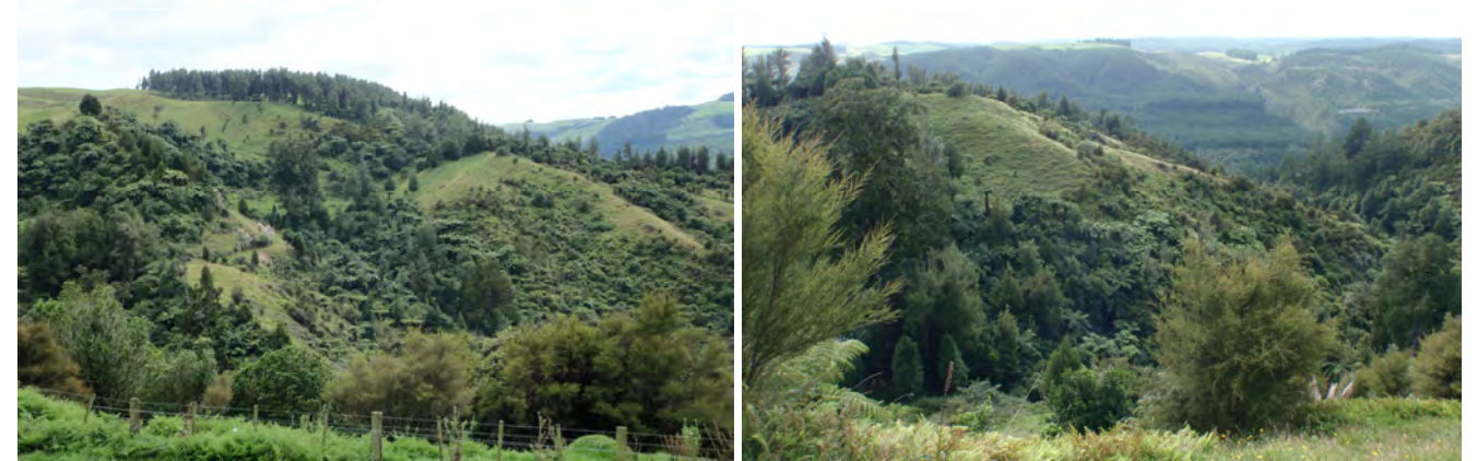
Photos 1 & 2: Proposed compartment 1 to be fenced for complete stock exclusion

Livestock access to the indigenous bush is impacting on vegetation cover and water quality, and is contributing to sedimentation in Lake Arapuni and its tributaries. The steep escarpment terrain (proposed compartment 1) is susceptible to stock induced sheet erosion, and stock access is having a very detrimental effect on undergrowth within the remnant.