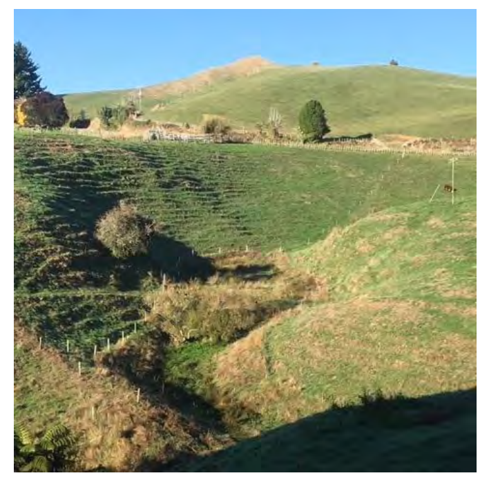
Tarr retired and planted wetland