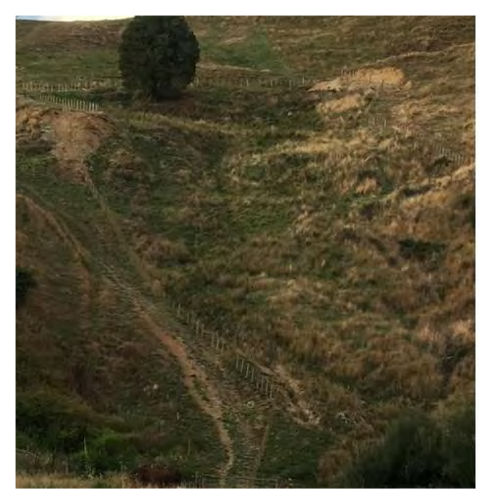
EW retired and planted wetland