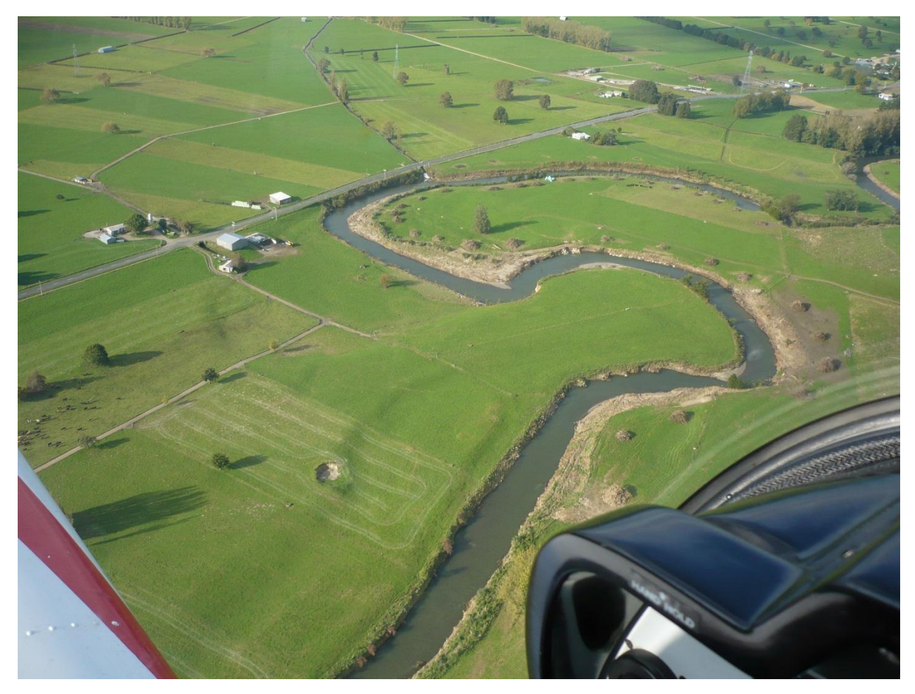
Willow Clearing, Otorohanga ~ April 2017