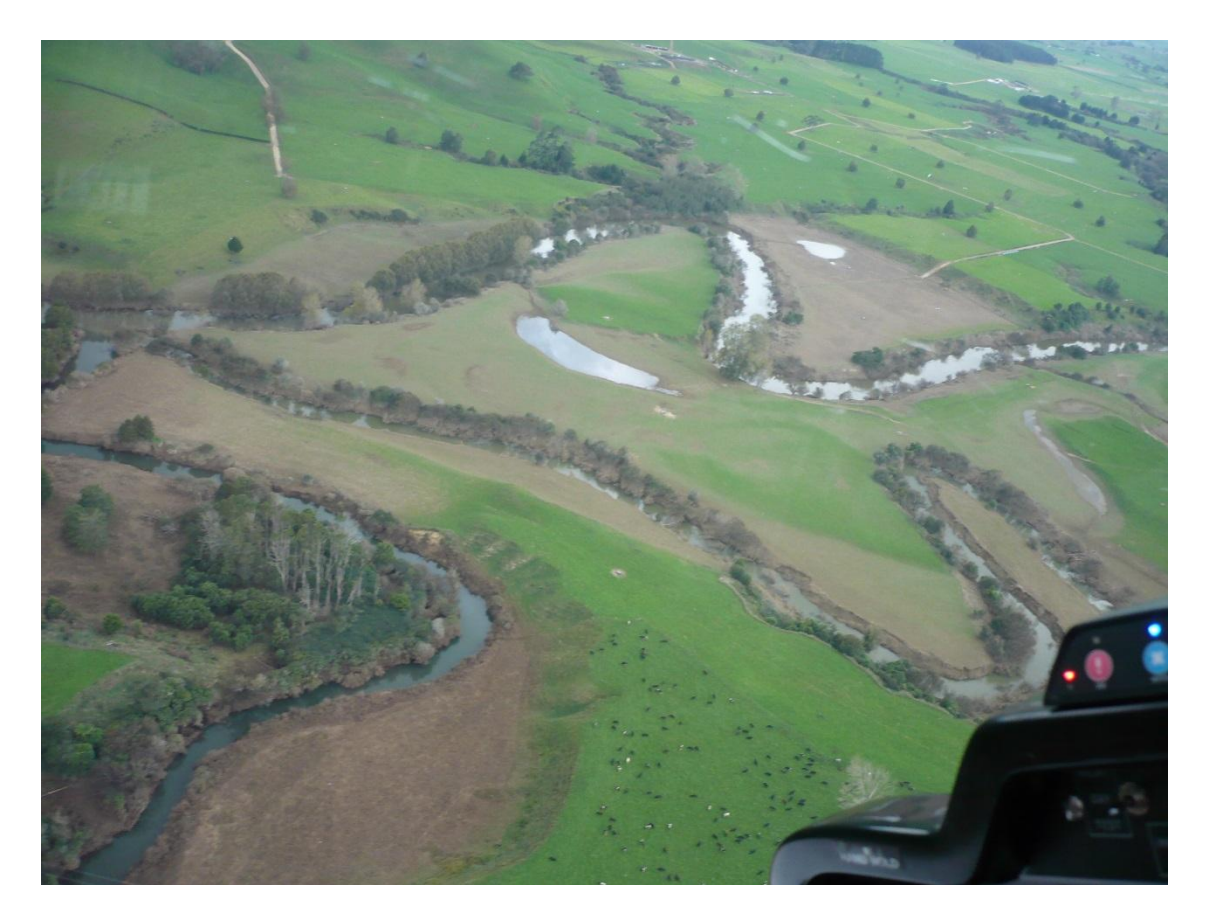
Waipa positive habitat, April 2017